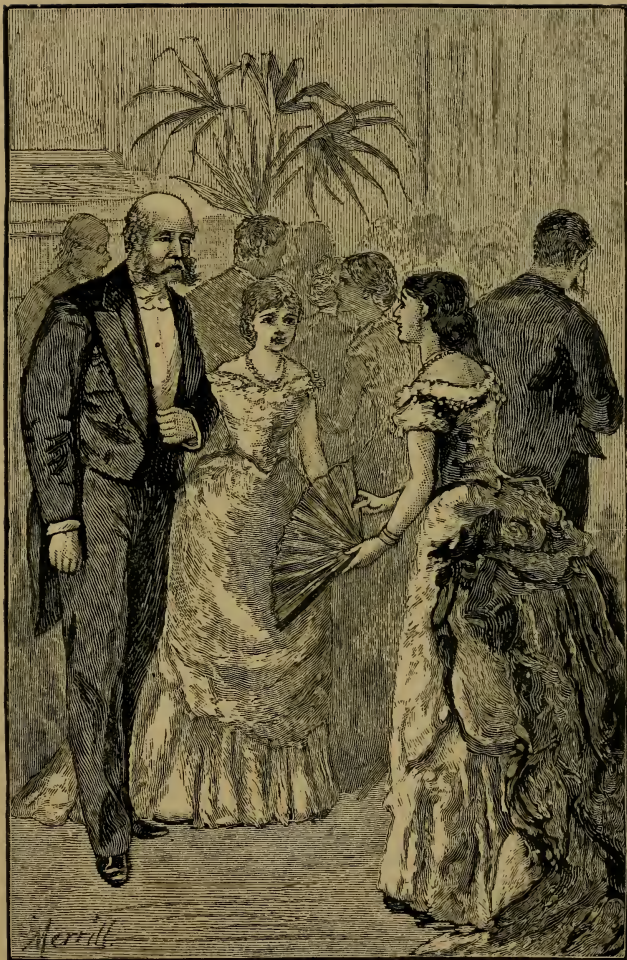
"We fell at once on Lady Waldemar." — Page 190.